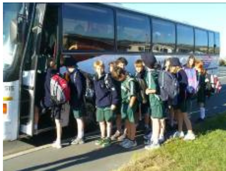
Room 17 boarding the bus for their Peninsula excursion.

As you can see we have been really busy during our first two weeks at Tahuna. This week we are visiting the Albatross Colony and the Aquarium with Room 24 and in Week 5 we are going on camp at Tirohanga.