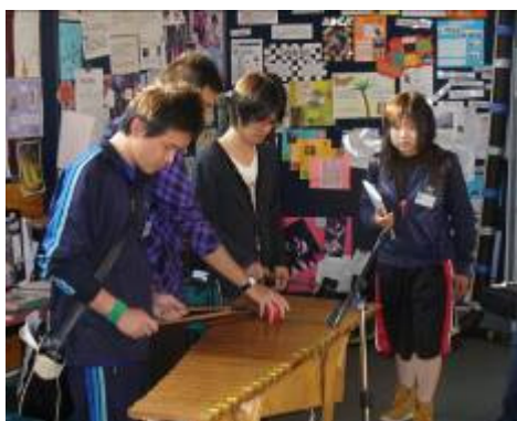
Three of the trainees try their skills on the marimba.