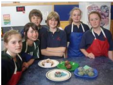
A variety of muffins with their Year seven creators.

Hopefully we will be asked back to judge again.