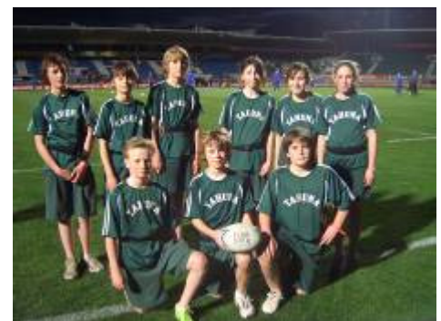
Tahuna Rippa Rugby 'A' Team 2009 Winners of Otago Year 7/8 Championship

From Portobello $ 27.00 - equates to $2.70 per trip From Luss Road Company Bay $ 22.00 equates to $2.20 per trip.