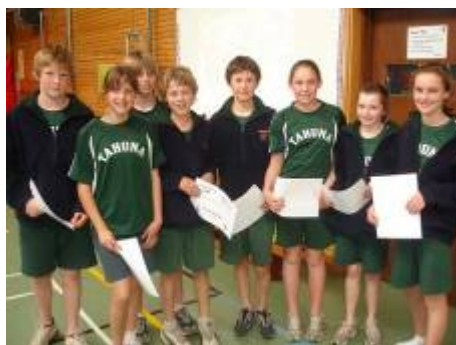
Activ8 team 2009

On Thursday 17 th September eight Year Eights went down to the College of Education to compete in the Active8 course around the Botanical Gardens and Logan Park.