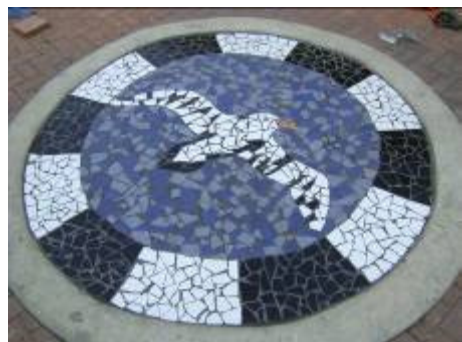
The finished piece of art which can be viewed outside Rooms 23 and 24.