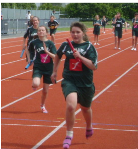
Above: the girls relay team storm home to finish 1, 2 . 3.

The Otago Athletic Sports will be held next Tuesday the 17 th November and Tahuna will have 28 relay teams competing across age groups and up to 80 athletes vying for Otago titles in individual track and field events. They will be up against the best from schools all around Otago and I am sure they will enjoy the fierce competition. We will keep you posted on their successes and wish them all the best.