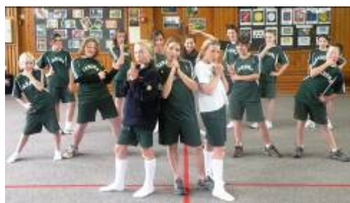
Above - the Hip hoppers in action.