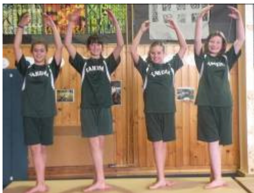
Above Ballet girls practise their moves.

“15 Minutes of Fame” This year we have incorporated several genres of dance as we explore the idea that, whilst we might aspire to be famous, fame may not be all it's “cracked up to be”. All 75 students have been rehearsing since the beginning of Term 2 and these students are our Year 7 Hip Hoppers and our Ballet girls.