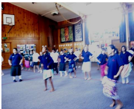
Above: Our Cook Island group practise during lunchtime for the Pasifika Festival later this year.