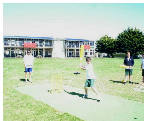
Above: lining up for the big one!

Monday was a lovely day and with the use of our all weather cricket pitch basic skills in bowling, running between wickets throwing and hitting, were introduced.