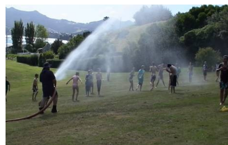
Above: Cooling off after a hard day

It was getting late but as I cruised down the dusty road towards home I knew children still had a game of spot light on the agenda. Well done teachers for all this extra time you've given for children and to parents and caregivers a BIG thanks as we could not do it without you.