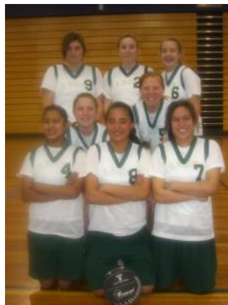
The proud, winning Year 8 Girls Miniball team.

Thank you to everyone who helped with coaching and support throughout the season.