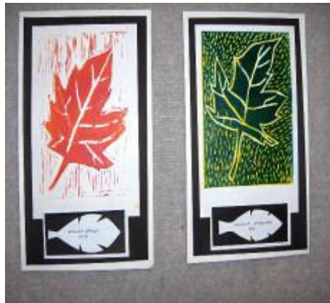
Fine Print Making Creations