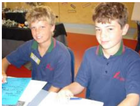
Good discussions and planning in the Art Room

We aim to have the school photos orders away next week. Please ensure any photos you want are ordered through the school office as soon as possible.