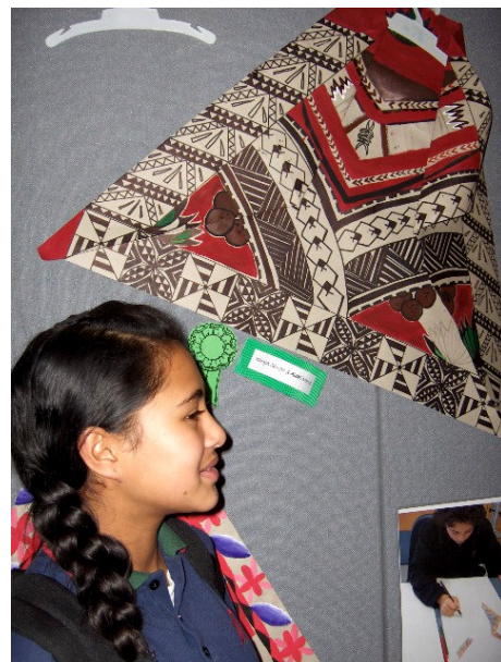
Great Art work Kirnjit