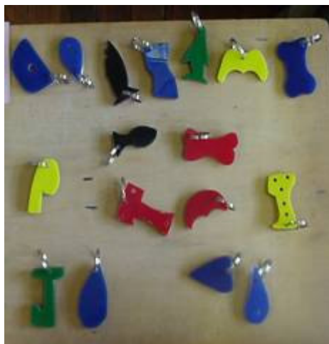
"Playing With Plastics" was the first unit for our new Year Seven

The year 8 Programme began with the 'Compound Curves Unit'. This project allows students the opportunity to work with sheet metal (aluminium), and create a compound curve. They were also introduced to the pop rivet gun and literally thousands of pop rivets have been used. They can make a bug if they wish, or a set of bowls, or some other zany creation! The emphasis is on accuracy of setting out (after consultation with local high school Technology Teachers). They were also assessed on their ability to form a compound curve from sheet metal. Hopefully your daughter or son has returned home with some cunning aluminium creation.