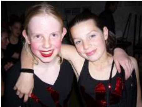
Stage makeup on, all smiles and ready to dance