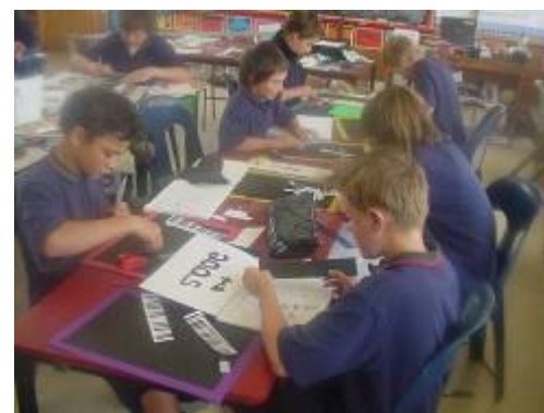
Artists busy at work