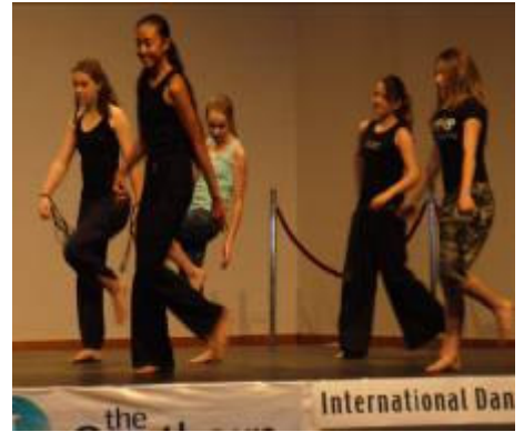
More dancers in action on Sunday

Please sign and return the following slip to acknowledge receipt of newsletter. Returned slips will go in the draw for a canteen voucher.