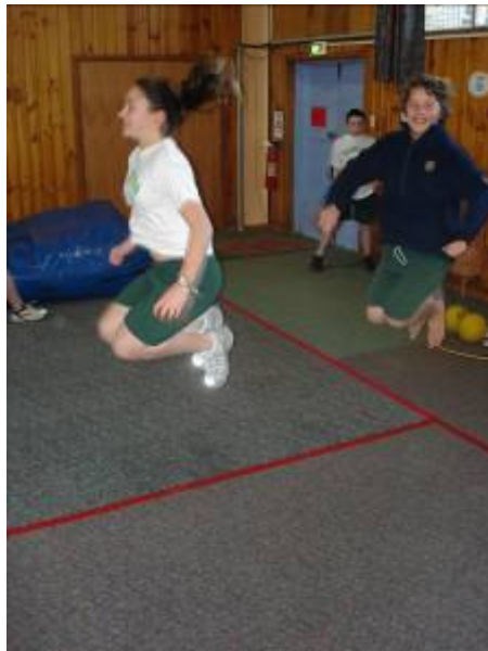
Energetic work in the fitness and warm up activities.

The current unit in PE is one on gymnastics. Equipment is organised around the hall and