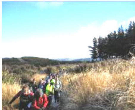
The Pineapple track

On Wednesday, the 9 th of August, room16 and 17 walked up the pineapple track from the bull ring and down through Ross Creek. We couldn't believe our eyes were seeing so much snow. With people throwing snowballs it made the walk more enjoyable. Up the top there was lot's of sun shining down on us and a great view over Dunedin where of course, we saw MITRE 10 MEGA, the Warehouse, and many more buildings including the school. Looking out at the hills now scares most of us because we didn't realise we had gone that high! When the bus came everyone was glad because after that we all felt like collapsing and falling off to sleep.