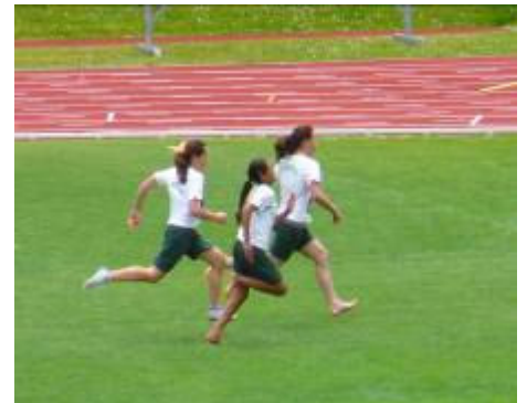
Three Tahuna girls sprinting well ahead of the rest of the field.