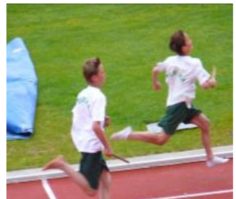
Tahuna relay teams showed great skill and team work that only comes from good practice.