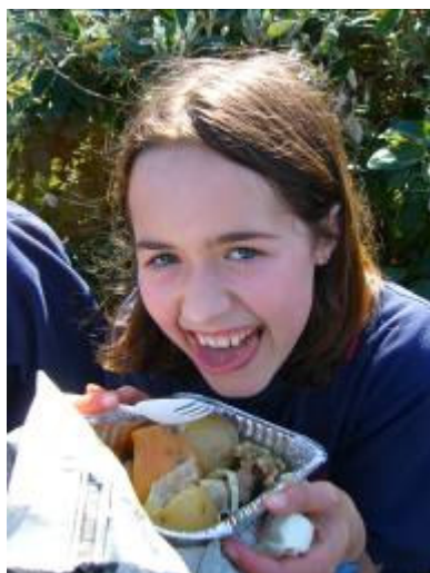
Eating the hangi