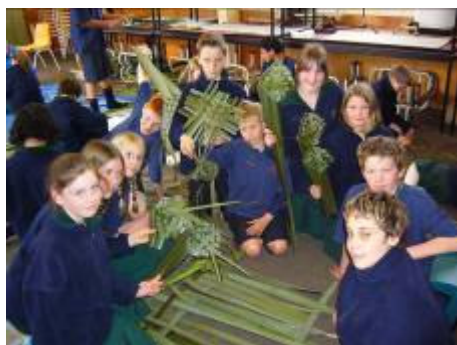
Brilliant flax weaving