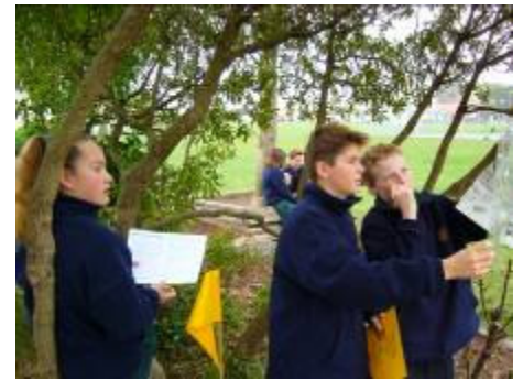
Studying Maori use of plants

helped make it an experience for our students to remember.