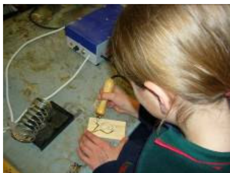
Creating Maori designs and burning in the detail