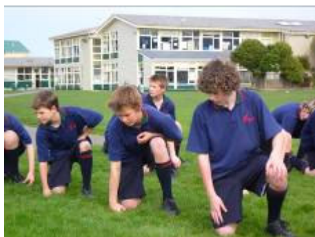
Enthusiastic haka practice