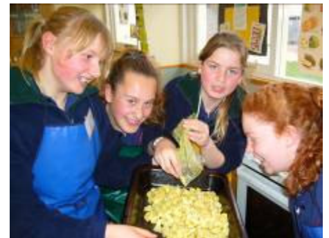
Oh so tasty