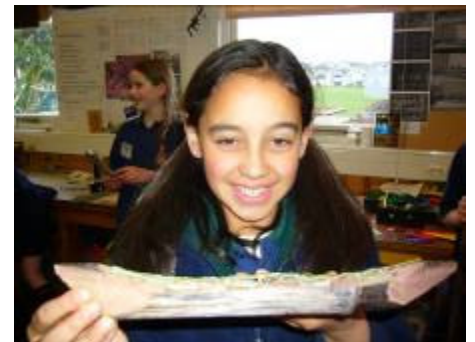
Carefully made canoe from the flax wood